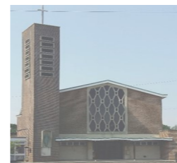
Holy Family Parish

incorporating the churches of Christ the King, Kinson & St Bernadette's, Ensbury Park