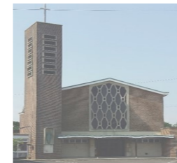
Holy Family Parish

incorporating the churches of Christ the King, Kinson & St Bernadette's, Ensbury Park