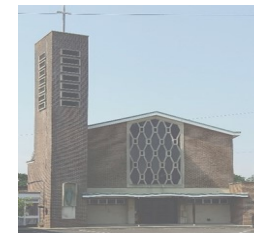
Holy Family Parish

incorporating the churches of Christ the King, Kinson & St Bernadette's, Ensbur Park