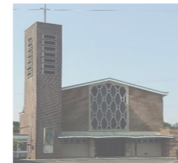
Holy Family Parish

incorporating the churches of Christ the King, Kinson & St Bernadette's, Ensbury Park