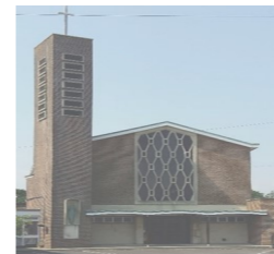
Holy Family Parish

incorporating the churches of Christ the King, Kinson & St Bernadette's, Ensbur Park