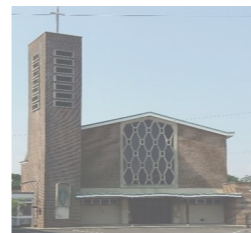
Holy Family Parish

incorporating the churches of Christ the King, Kinson & St Bernadette's, Ensbury Park