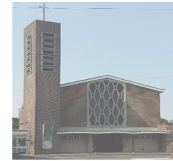
Holy Family Parish

incorporating the churches of Christ the King, Kinson & St Bernadette's, Ensbury Park